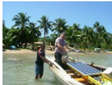
A friendly technological invasion at Fiji's Ono-i-Lau Island.

The implementation of BGAN satellite communication systems and the availability of the SYNOP generator integrated with data collection have greatly enhanced monitoring capability, not just for Fiji, but for other Pacific Island countries where similar work is being completed.