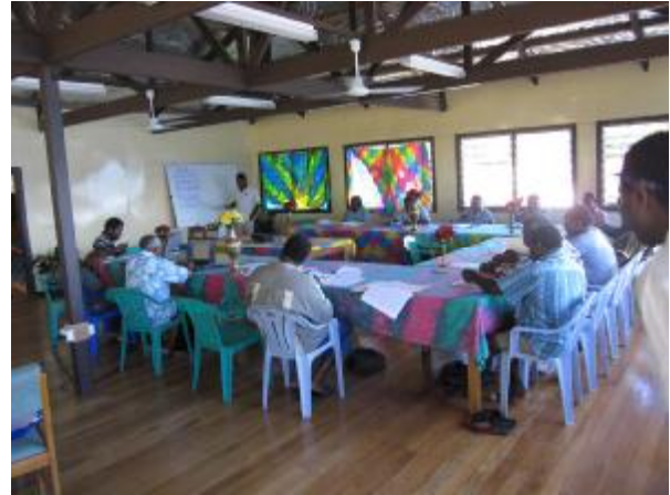
Solomon Islands National DRM planning meeting.