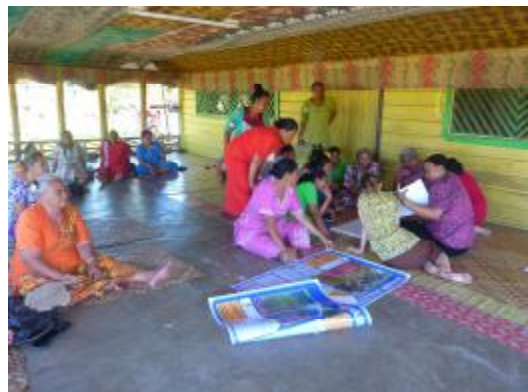
Community tsunami evacuation zone planning in Samoa.