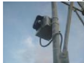
BGAN Satellite aerial mounted on the side of a mast facing a geostationary satellite.